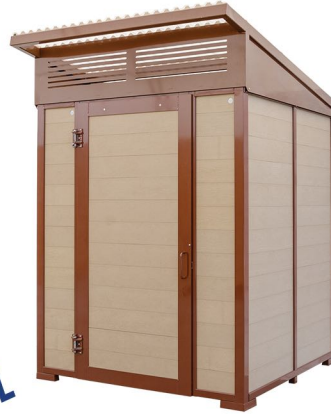
FOREST ADA COMPLIANT [68" W x 80" D] FOREST JUMBO [68" W x 68" D]