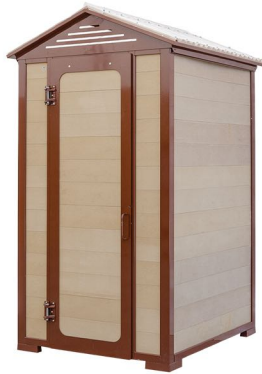
JOHN REGULAR [48" W x 55" D]