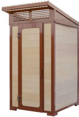
FOREST REGULAR [48" W x 55" D]