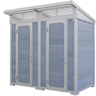
FOREST DOUBLE [96" W x 55" D]